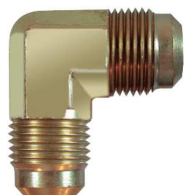
Cotovelo União 90° – AZ 207-G