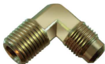
Cotovelo Macho 90° – AZ 206-G