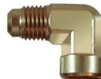
Cotovelo Fêmea 90° – AZ 208-G