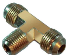
Tee Macho Central – AZ 210-G