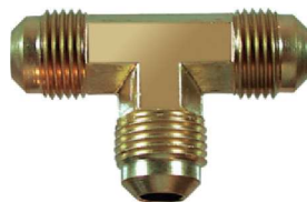
Tee União – AZ 212-G