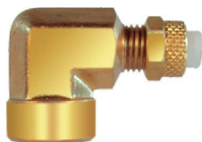
Cotovelo Fêmea 90° – AZ 670-PF