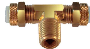
Tee Macho Central – AZ 672-PF