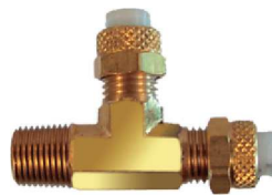
Tee Macho Lateral – AZ 671-PF