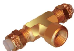
Tee Fêmea Central – AZ 677-PF