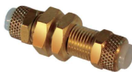
União Bulkhead – AZ 682-PF